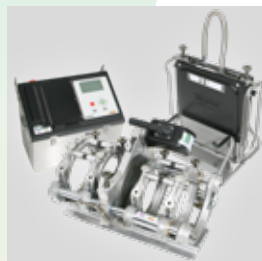
Butt fusion machine of suitable size and liners (if required)