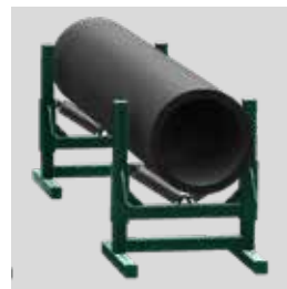
Pipe support rollers