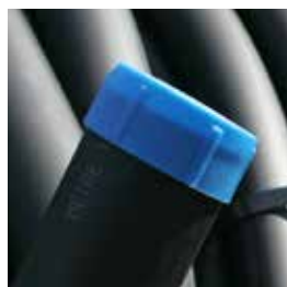
Pipe end covers