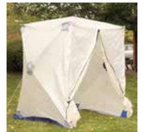
Welding tent/shelter and ground sheet