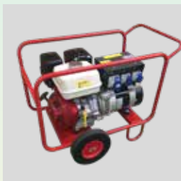
Generator of suitable size to power butt fusion machine - refer to manufacturers' literature for power requirements