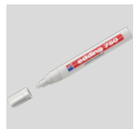
Indelible marker pen for marking beads