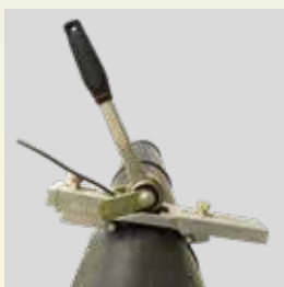
External / Internal de-beading tool